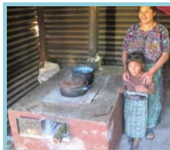
Materials/cooking stove $100