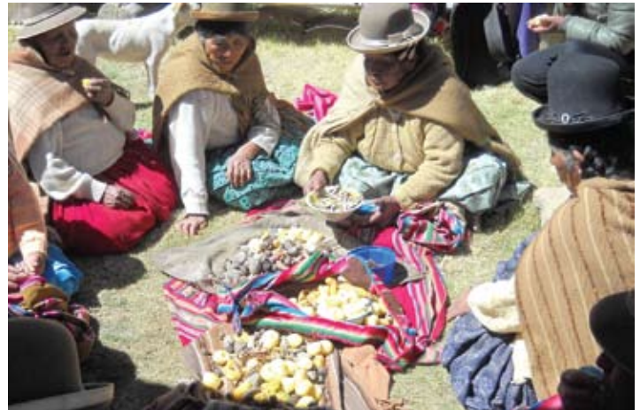
Bolivia's farmers grow their staple crops of potatoes and quinoa in challenging circumstances on small plots of land in the cold, dry highlands. Small irrigation systems and other agriculture inputs funded by SHARE are helping to improve production.