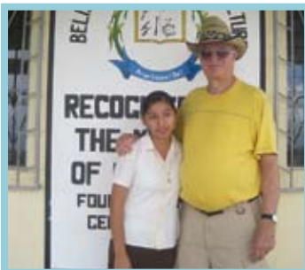
High School Scholarship $300