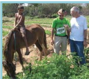
Agriculture Training $100