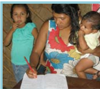
Adult Literacy $100