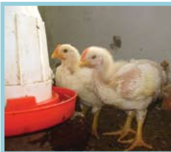
Agriculture Inputs $25-$200