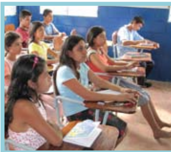
Vocational Training for Youth/Supplies $30-$60