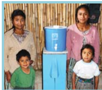
Water Filter Program Up to $200