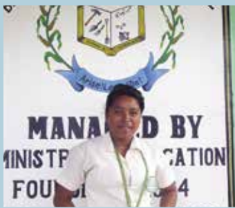
Education Up to $400