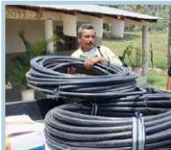
Irrigation $100 - $1200