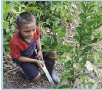
Seeds, trees $20 - $100