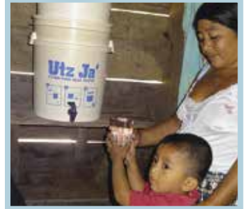
Water filters $50 - $200