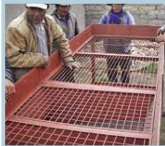
Equipment, tools $100