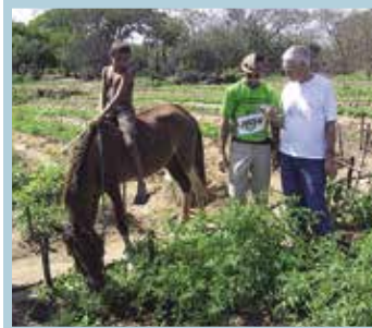
Agriculture Training $100