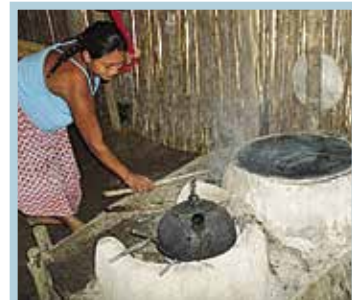
Improved stoves $50 - $200