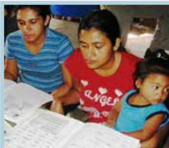
Adult Literacy $100