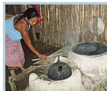
Improved stoves $50 - $200