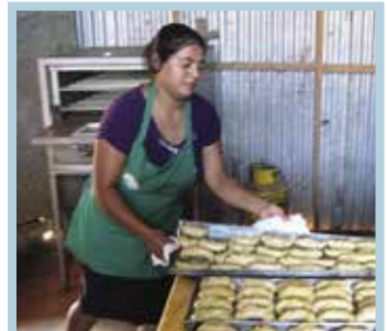
Youth Skills Training $100