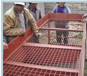
Equipment, tools $100