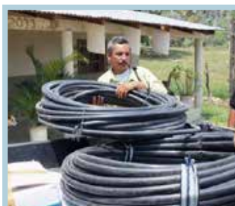
Irrigation $100 - $1200