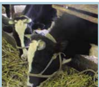
Cow Up to $1,200