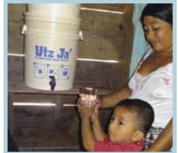
Water filters $50 - $200