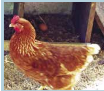
Poultry, fish, rabbits $25