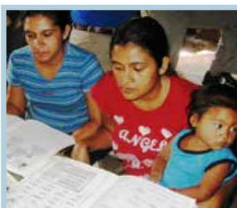
Adult Literacy $100