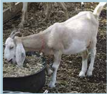
Small Livestock Up to $150

Your donation helps to SUSTAIN AND GROW SHARE's important work!