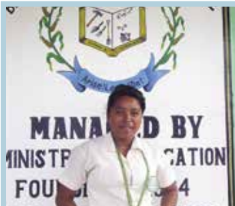
Education Up to $400