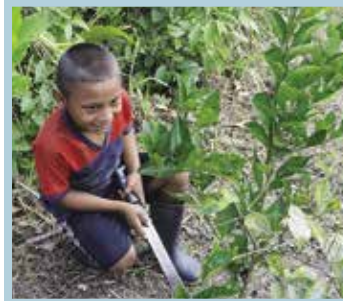
Seeds, trees $20 - $100