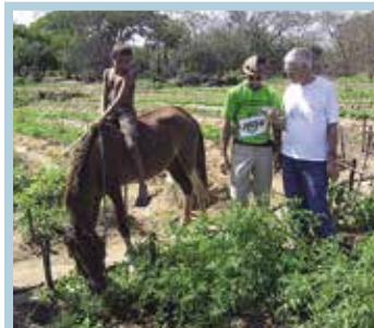
Agriculture Training $100